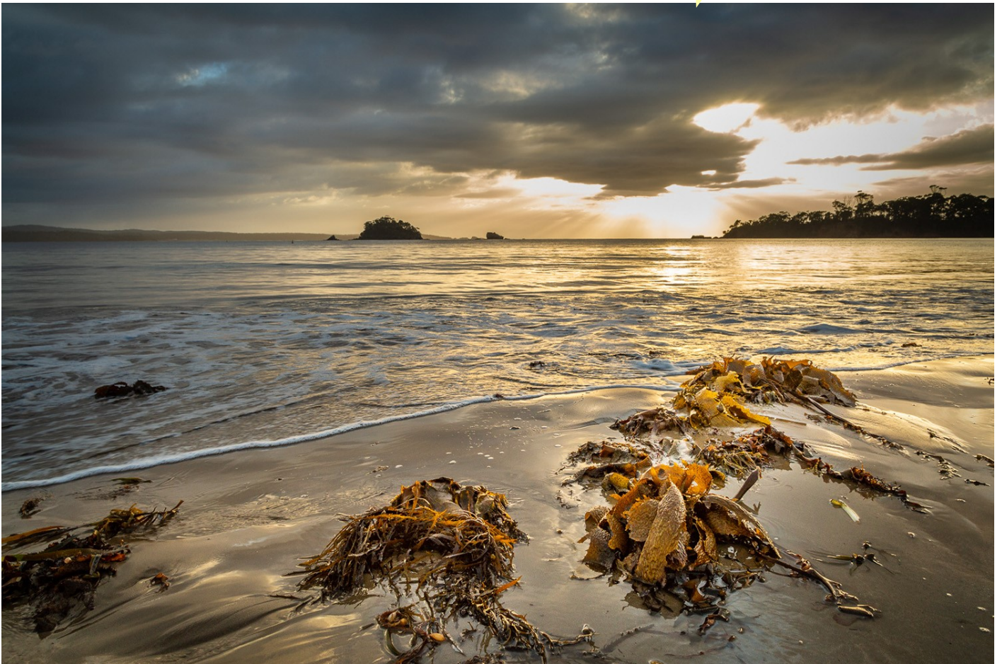
Gold on Gold