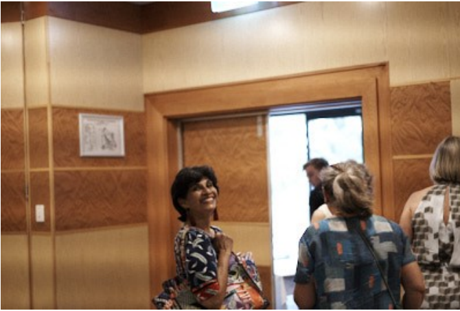
Members and their guests at the Annual Dinner