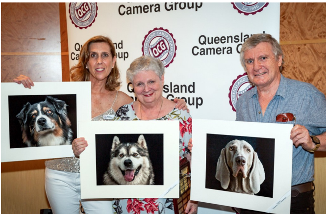
3 Related Images