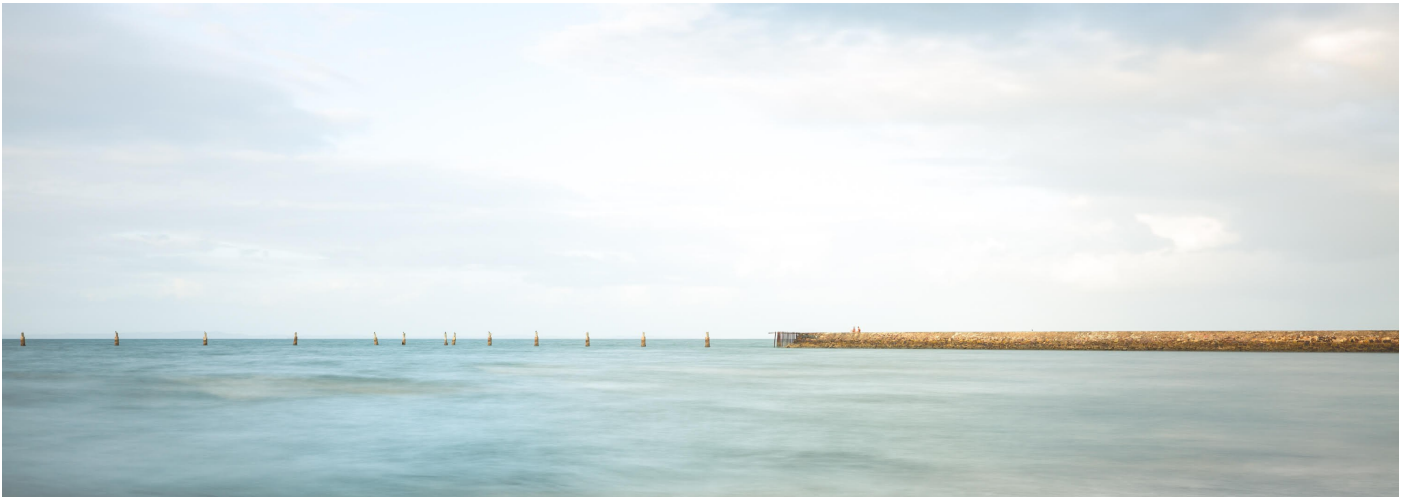
November Photowalk